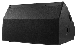
MONITOR 2 Lead Vocalist