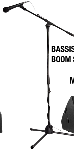
BASSIST BOOM STAND