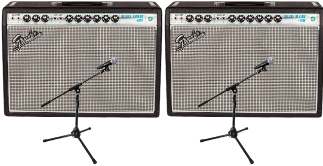
STEREO GUITAR RIG