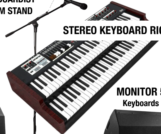
STEREO KEYBOARD RIG