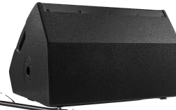
MONITOR 4 Bassist