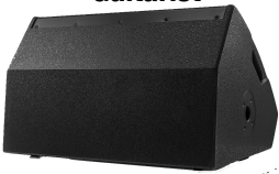
MONITOR 1 Guitarist