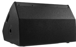
MONITOR 3 Lead Vocalist