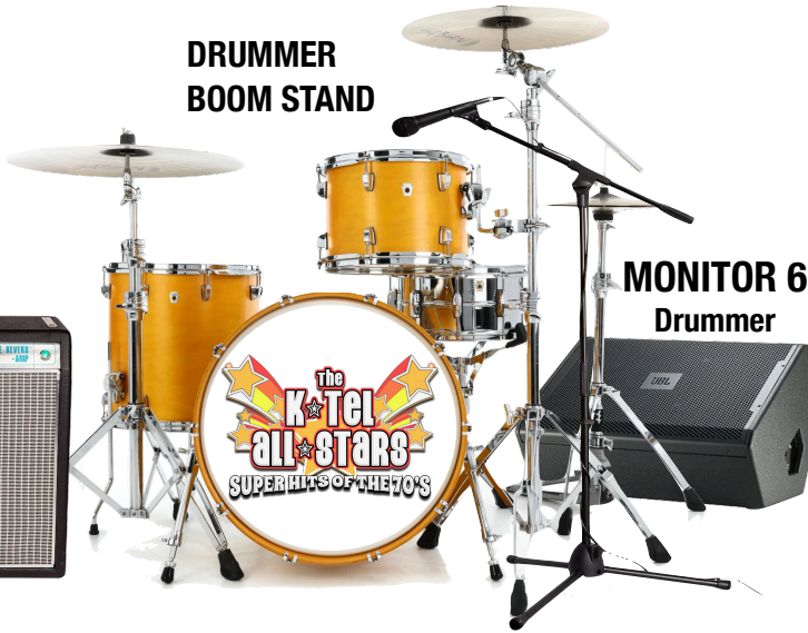
MONITOR 6 Drummer