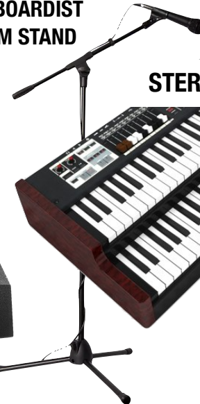
STEREO KEYBOARD RIG